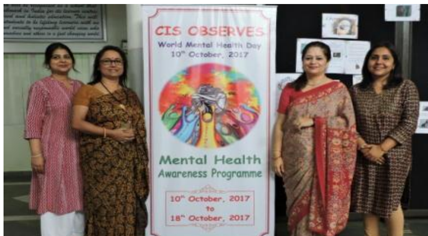
World Mental Health Day observed in CIS