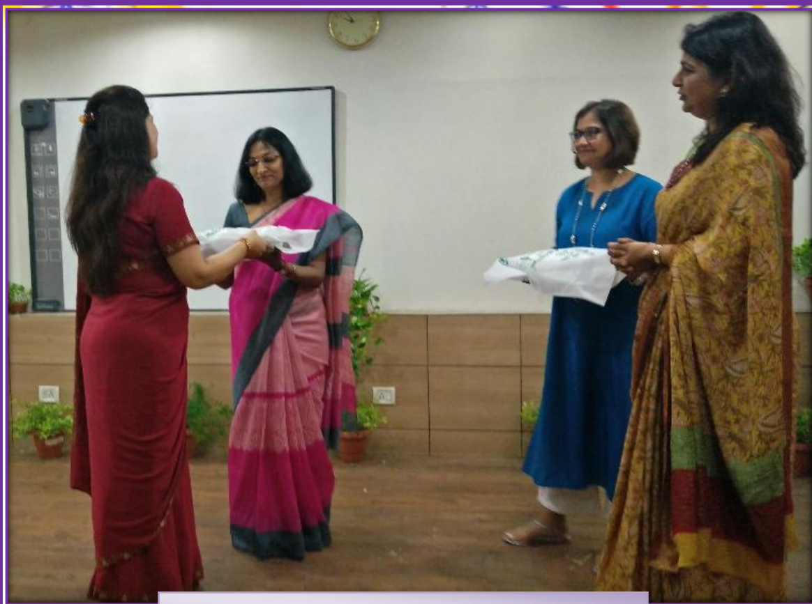
Felicitation of the Judges